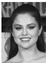
Hair Half Back